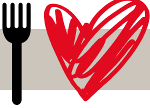
TABLE OF HOPE MONDAY MAY 7, 2018 LE SALON RICHMOND, 550 RICHMOND