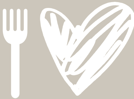
TABLE OF HOPE 2018

BENEFITTING SHARE THE WARMTH MONDAY MAY 7, 2018