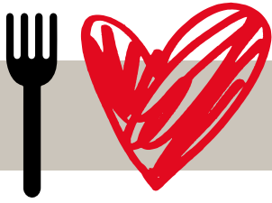
TABLE OF HOPE MONDAY MAY 7, 2018 LE SALON RICHMOND, 550 RICHMOND