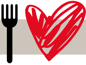
TABLE OF HOPE MONDAY MAY 7, 2018 LE SALON RICHMOND, 550 RICHMOND

"I have the audacity to believe that people everywhere can have three meals a day for their bodies, education and culture for the minds and dignity, equality and freedom for their spirits." - Martin Luther King, Jr.,